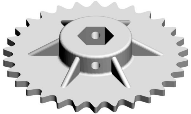
Fig. 6.2.2.3 Rendered Solid Model

Note: Use the GEARS-IDS spread sheet entitled Equations for the Design of Standard Sprocket Teeth to check answers to the equations listed in Table 6.2.2.2.